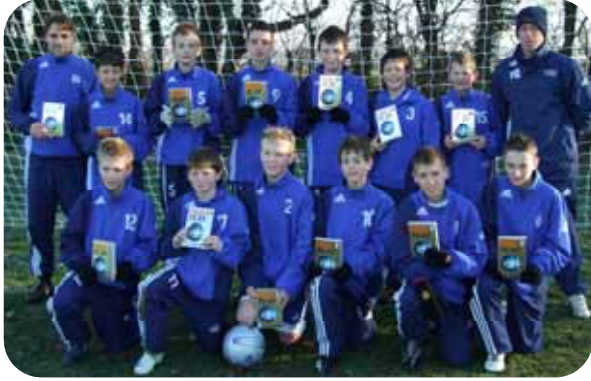
Gunton Football Club U13s pictured in their new kit with books to celebrate the National Year of Reading 2008