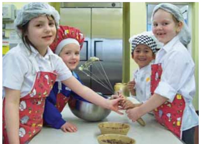
Young 'Shepherds' making their pies at Howard Infant School King's Lynn

then fried them with the meat and other ingredients. They then cooked, mashed and piped their own Shepherd's Pie with the potato, being creative with the piping and design-